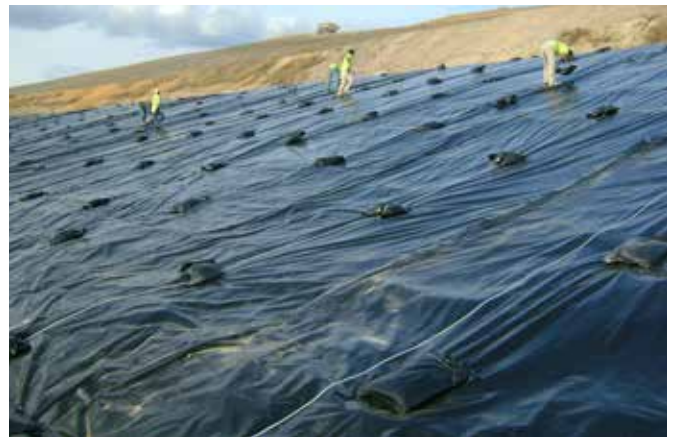
Temporary Rain Shed Cover