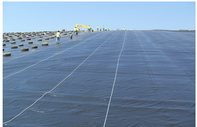
Temporary Rain Shed Cover