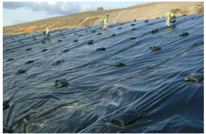
Temporary Rain Shed Cover