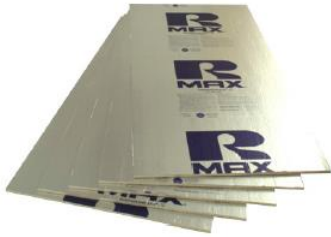
Figure 1a: Thermasheath®-3

4.1. Thermasheath®-3, Thermasheath®-XP, TSX-8500, TSX-8510 and TSX-8520 are non-structural foam plastic insulating sheathing (FPIS) panels consisting of a closed-cell rigid polyisocyanurate (polyiso) foam core bonded to various facers ( ASTM C1289 Type I, Class 1).