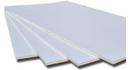
Figure 1c: TSX-8510

4.1.1. Thermasheath®-3 consists of a polyiso core bonded to Kraft reinforced aluminum facers on each side. Both sides have a reflective surface.