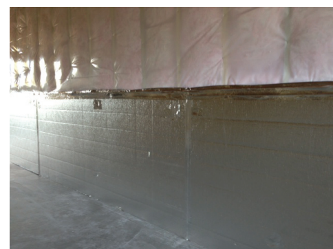
Thermasheath-XP is an excellent product for use in insulating the interior side of basement walls. It may be adhered or anchored directly to the concrete surface or attached to the furring strips.