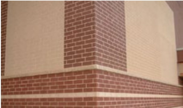
Variations in the brick's color and positioning create endless design options