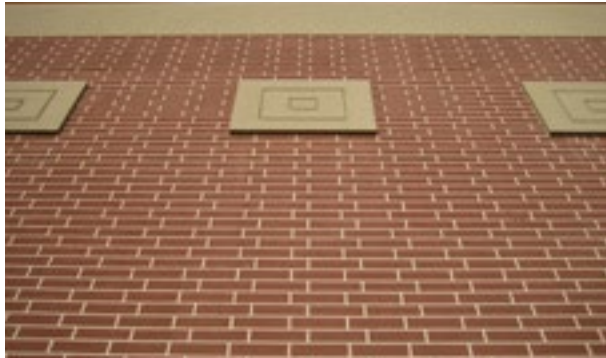
A raking stretcher bond appearance with finished foam shapes to accentuate the wall