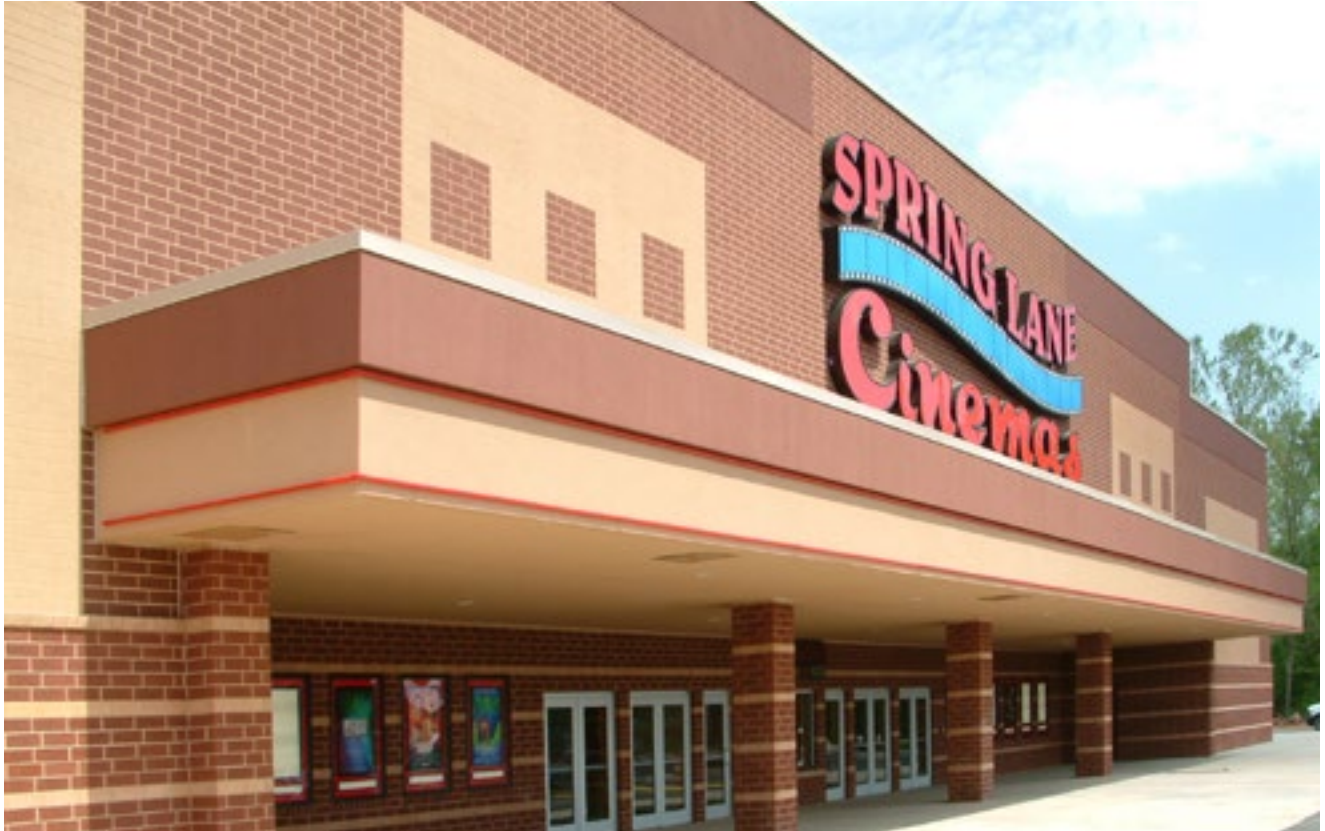
SENERBRICK FINISH allows you to achieve the appearance you want, using one trade and in less time