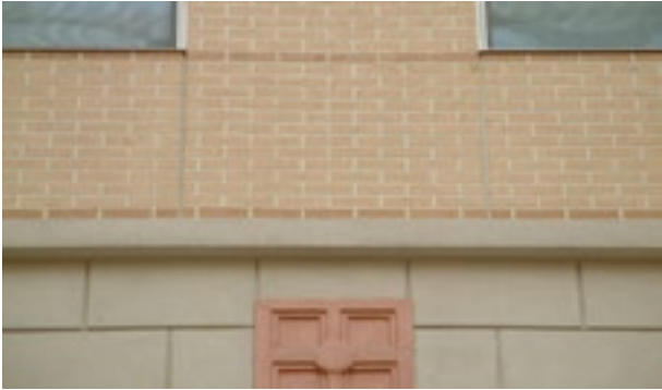
The block, accent medallion and running bond appearance (with darker stretcher bond accent rows), are all done in EIFS