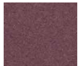
6085 Winter Sunset