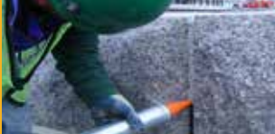
SEALING AND BONDING