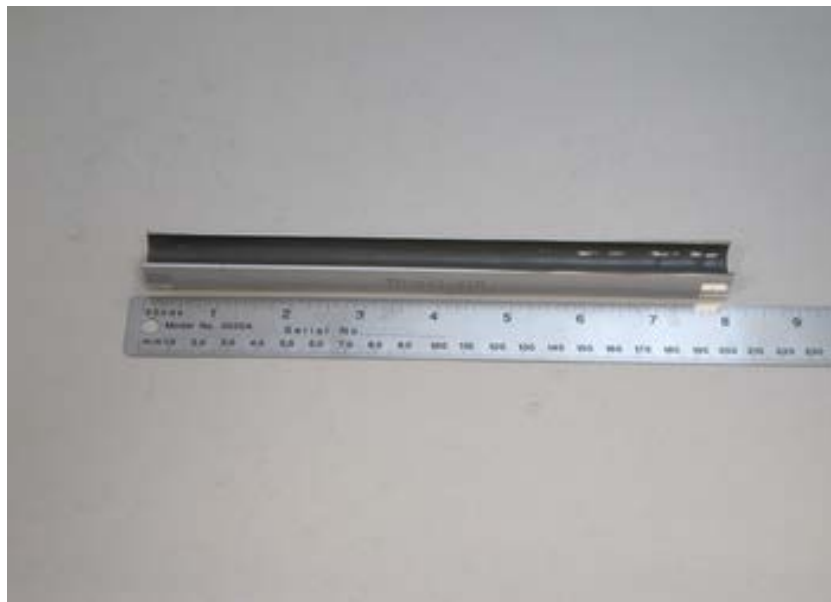
Photo Documentation – The product sample specimen is photographed immediately following specimen preparation and prior to initiating the conditioning period. Typically, the top and bottom faces of the specimen are photographed. Bottom faces may show a stainless steel plate or other substrate if prescribed by the standard.