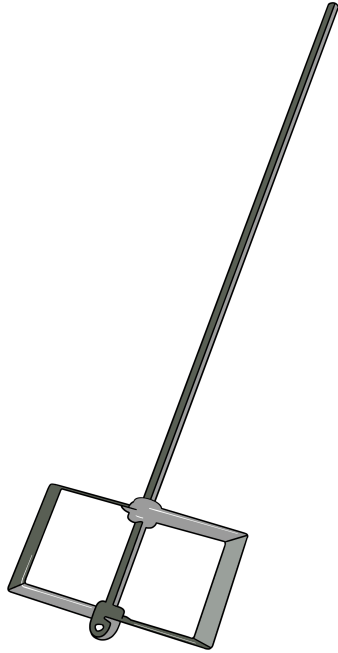
Top: Jiffy Style Paddle Bottom: Mud Mixing Paddle