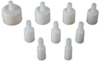
Adhesive Piston Plug Family

The matched tolerance design between the piston plug and drilled hole virtually eliminates the formation of voids and air pockets during adhesive dispensing.