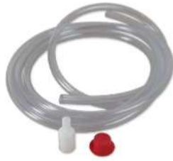
Piston Plug Delivery System