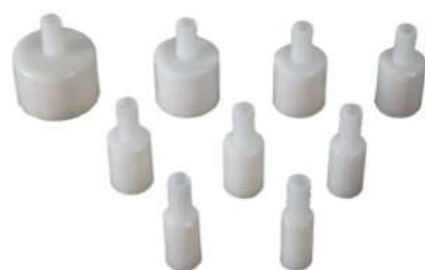
Adhesive Piston Plug Family

The matched tolerance design between the piston plug and drilled hole virtually eliminates the formation of voids and air pockets during adhesive dispensing.