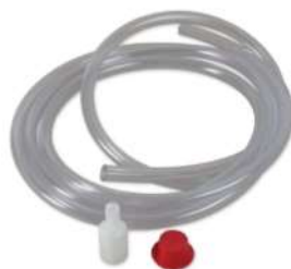
Piston Plug Delivery System