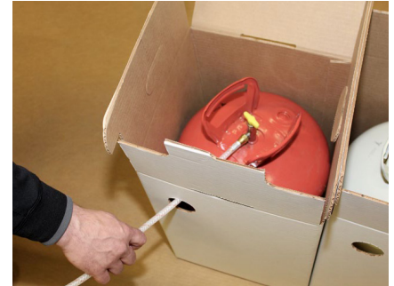
Step 3. Insert hoses through holes in side of carton.