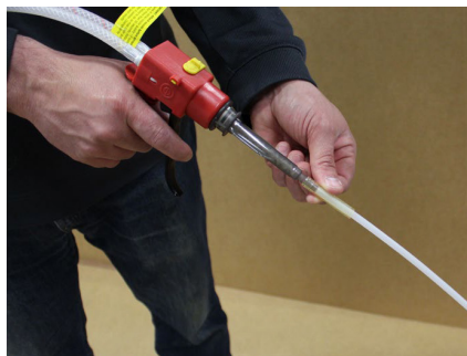
Step 8. For stand-up applications, users can elect to attach an extension tube to the mix tip. Simply, slide the extension tube over the end of the mix tip until it fits snugly. Ensure the extension tube is engaged with all 3 barbs of the mix tip.