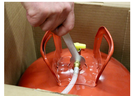
Step 6. Tighten both fittings with the 9/16-in. wrench (provided) by turning an additional \frac{1}{6} turn until firmly attached. DO NOT OVER-TIGHTEN! Close lid of each box to protect from sun, wind and dirt.