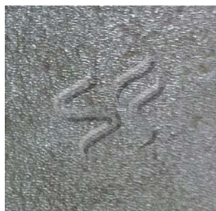
Zoomed In Texture Image