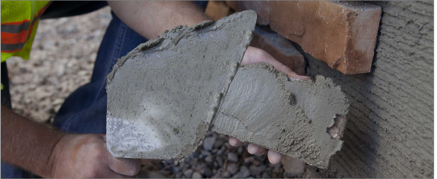
Engineered for optimal workability, bond strength and durability, SPEC MIX Adhered Veneer Mortars are superior