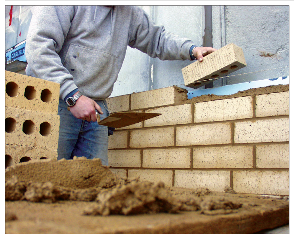
Consistent custom colored mortar, every time