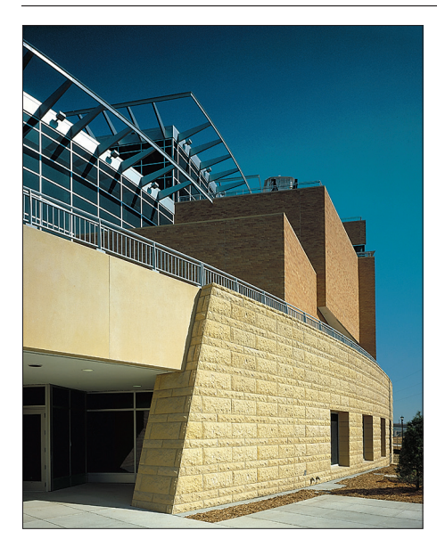
Aesthetic and structural performance, every project

IMPORTANT! READ BEFORE USING This product contains Portland cement. Contact with freshly mixed product can cause severe burns. Avoid direct contact with skin and eyes. If this product should contact eyes, immediately flush with water for at least 15 minutes and consult a physician. For skin exposure, wash promptly with plenty of soap and water. Remove soaked clothing promptly. If this product burns your skin, see a physician immediately. This product may contain silica. Silica dust if inhaled may cause respiratory or other