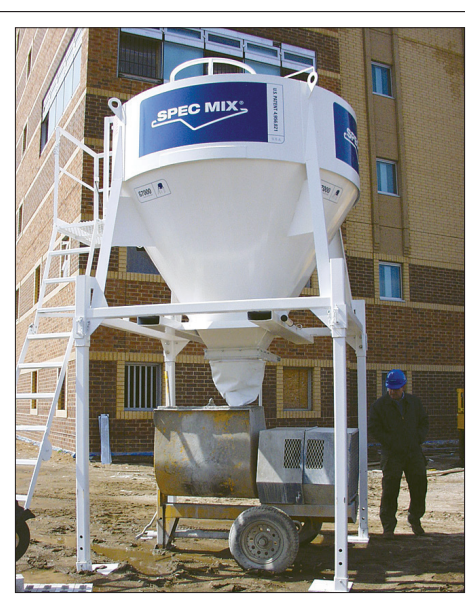
Patented Mortar Delivery System

SPEC MIX masonry mortars and colored mortars are available in 80 lb (36.3 kg) packages for easy hand loading. For increased