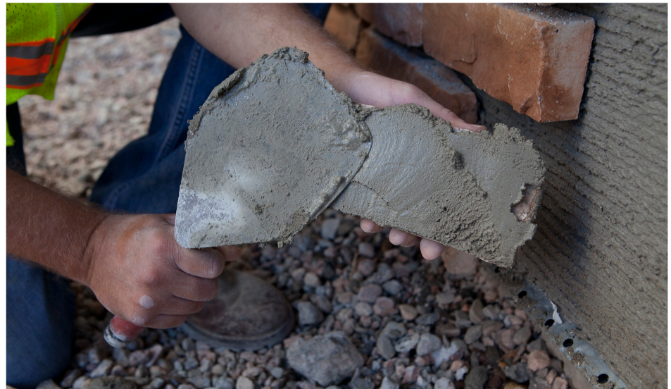
Engineered for optimal workability, bond strength and durability, SPEC MIX veneer mortars are superior