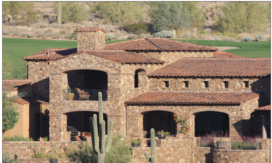
From custom homes to commercial projects, SPEC MIX Polymer Modified Stone Veneer Mortar is the ultimate material when building with adhered stone veneer masonry.

SPEC MIX Polymer Modified Stone Veneer Mortar (PMSVM) is a technically advanced mortar used to bond thin veneer masonry units to a substrate. It is an ideal solution for architects and contractors having projects with an immediate and ongoing need for mortar delivering high bond strength and sag resistance during installation. The non-sag formulation provides excellent workability, cohe-