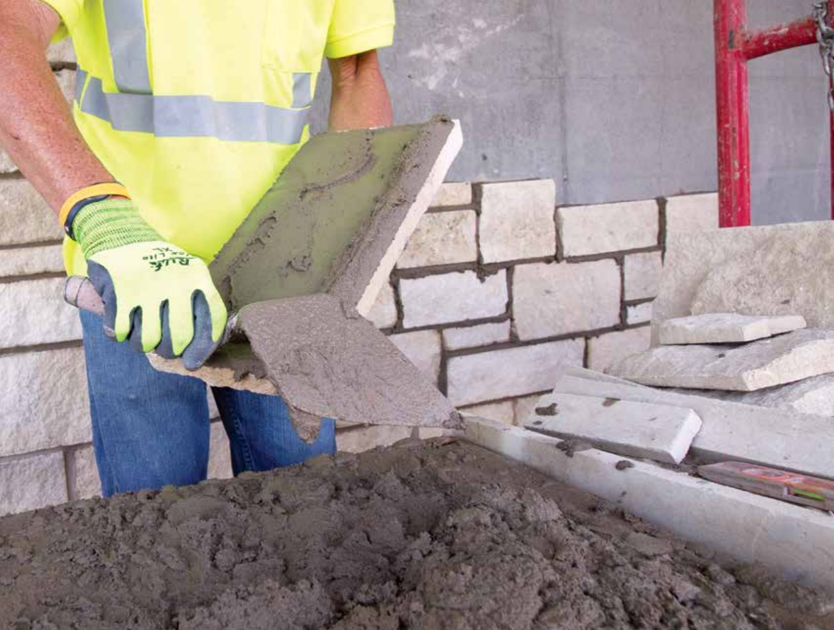
PMVM APPLIED TO NATURAL THIN STONE FOR BOND COAT APPLICATION TO CONCRETE