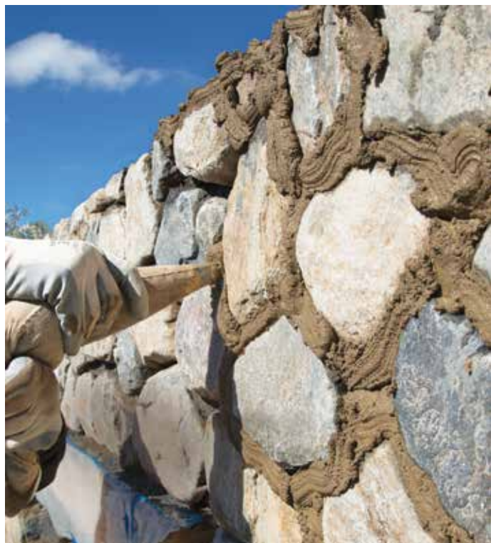
COLORED AVM USED IN JOINT GROUT APPLICATION

Regardless of the application, SPEC MIX product formulations are designed with the installer in mind. Meeting specifications and standards is a necessity— at SPEC MIX delivering a mason friendly mix for easy installation, higher productivity and maximum profitability is our promise! Choosing from our line of adhered veneer products locks in quality assurance and performance.