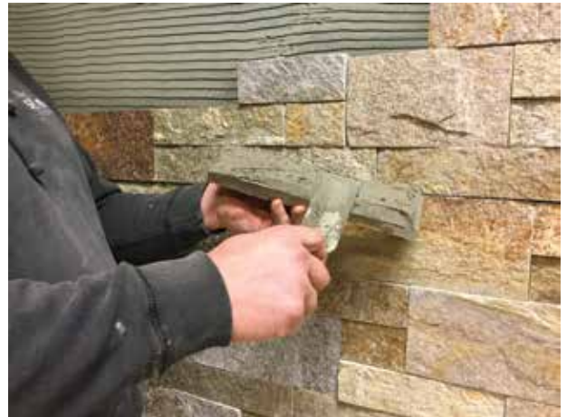
XP500 ADHESION MORTAR WITH NATURAL THIN STONE FOR BOND COAT APPLICATION

SPEC MIX XP500 should not be used in a scratch coat over lath or a joint grout application. XP500 comes packaged in 50 lb (22.6 kg) bags. It exceeds ANSI A118.4 and ANSI A118.15 applicable requirements as well as TMS 402/602 Building Code Requirements and Specification for Masonry Structures shear strength requirements when tested in accordance with ASTM C 482. Project submittals are available upon request; data sheet and SDS is available at www.specmix.com .