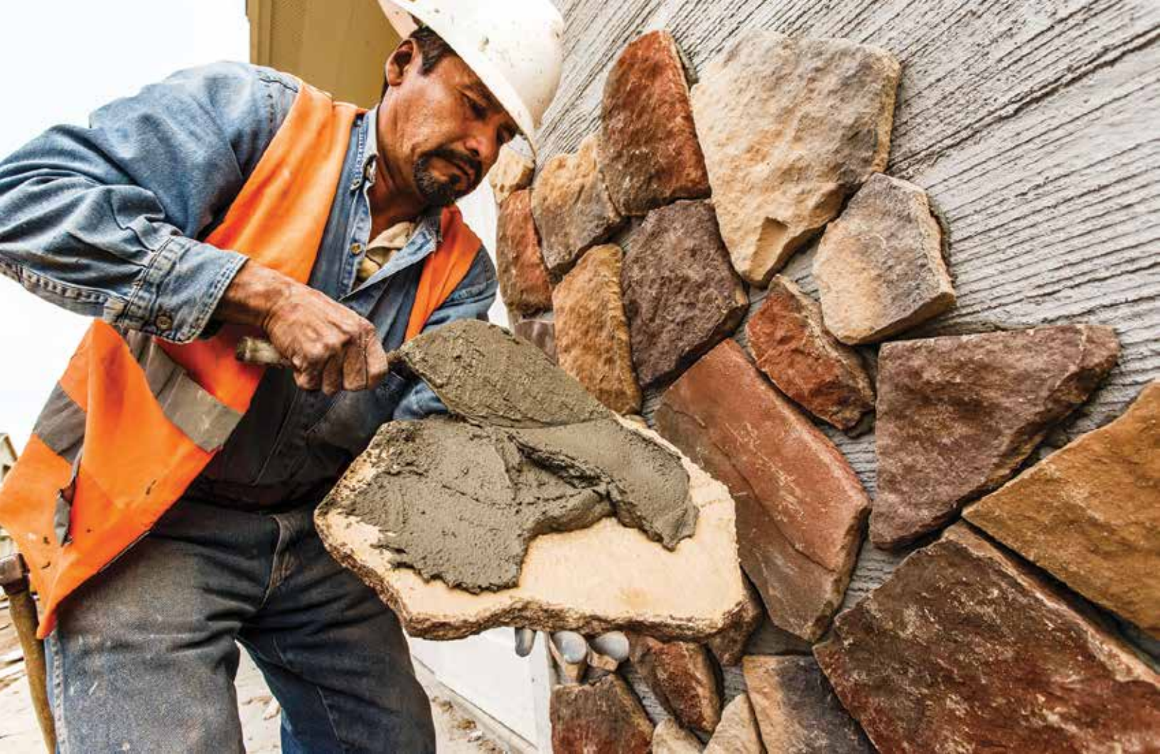
AVM USED WITH MANUFACTURED STONE FOR BOND COAT APPLICATION