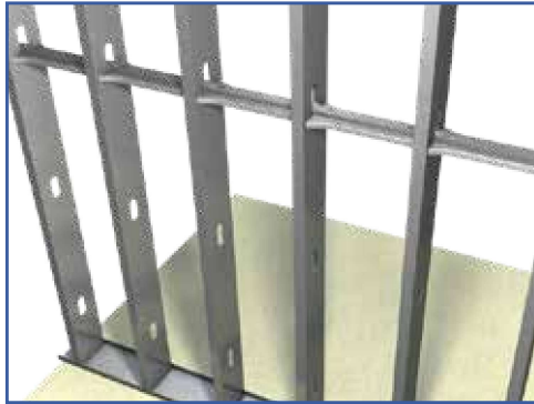
When using BuckleBridge in curtain walls with standard "cee" studs, one screw is only needed every 3rd stud.*