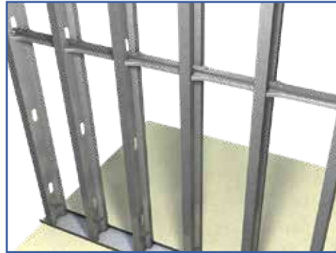
BuckleBridge used in load bearing walls with TSN's SigmaStud