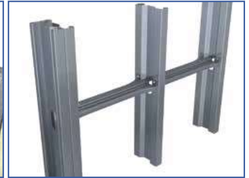
BuckleBridge works just as easily with back-to-back studs.