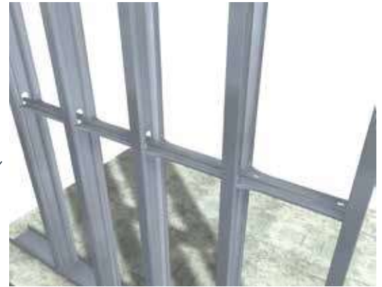
US Patents #7,596,921, #7,836,657 & #8,205,402 Load Direction