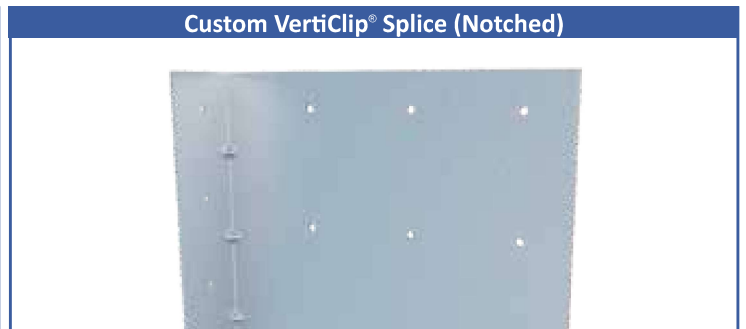
Unique condition brought to TSN by Specialty Engineer. TSN helped design a solution and test & fabricate clips.