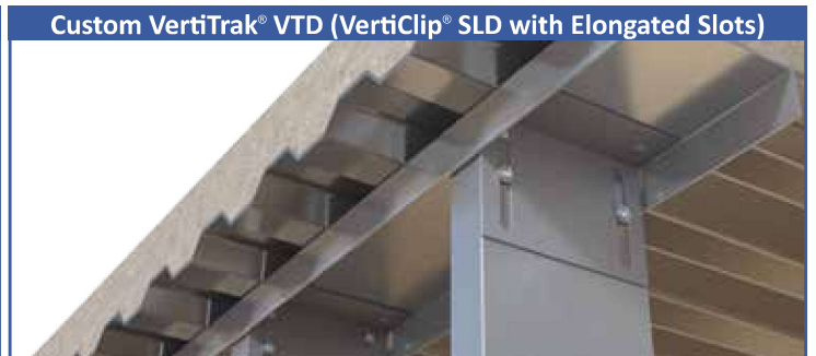
VertiTrack VTD modified to accommodate 4" slots in VertiClip SLD provides an effective, efficient solution for large demising walls typically seen in retail stores and theaters.