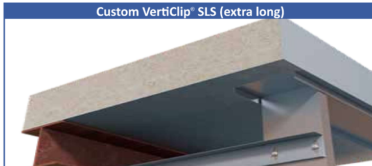
Retrofit situation where a stud does not run full height, creating a situation where a modified VertiClip SLS was lengthened to bridge a large gap from the structure of 26".