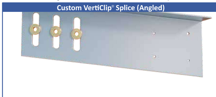
Unique condition brought to TSN by Specialty Engineer. TSN helped design a solution and test & fabricate clips.