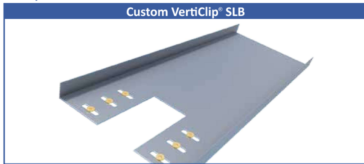
Unique condition brought to TSN by Specialty Engineer. TSN helped design a solution and test & fabricate clips.