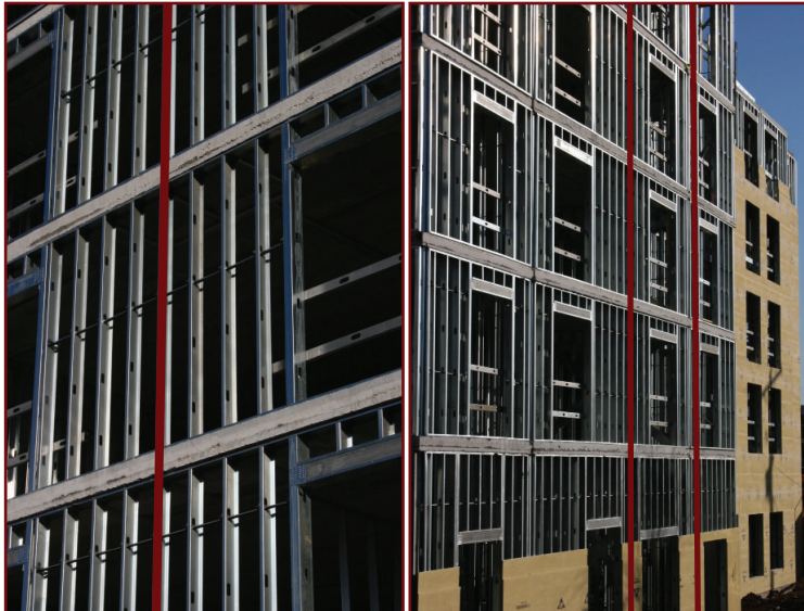
Example of framing aligned vertically. The red lines trace the axial load vertically from the roof to the foundation.

Building loads must transfer from the vertical element above (e.g. SigmaStud® wall) to the horizontal element (e.g. Floor System), and to the vertical bearing element below (e.g. SigmaStud wall). To achieve this load transfer, the wall framing must align vertically.