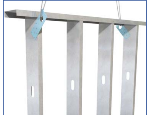
Attachment to Stud Web