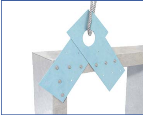
Double Attachment to Wall at End Stud