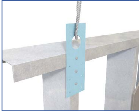
Attachment to Wall at Intermediate Stud