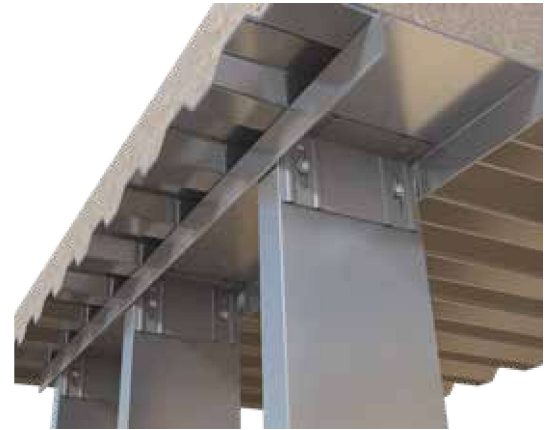
US Patents #5,467,566 & #5,906,080