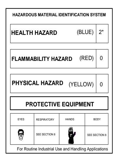
Hazard Scale: 0 = Minimal 1 = Slight 2 = Moderate 3 = Serious 4 = Severe * = Chronic hazard

DEGREE OF EFFECT TO THE HEALTH OF THE POLLUTING AGENT OF ENVIRONMENT OF WORK (per Mexican NOM-010 STPS-1999): 0