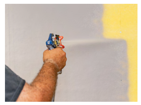
ASTM C1177 gypsum sheathing is smooth and nonporous with limited moisture absorption. High membrane thickness can extend drying time. Already an air barrier material and much less prone to pinhole formation, gypsum sheathing can be effectively protected with a thinner, single coat Sto AirSeal membrane.