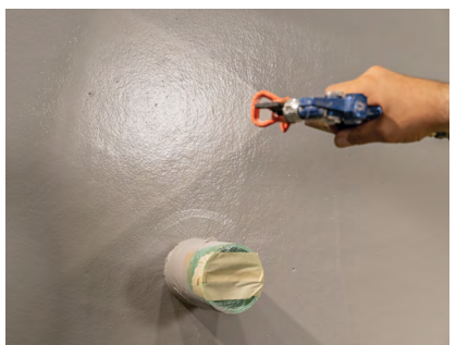
StoGuard Detail Components receive a fully compatible overcoat of Sto AirSeal for extra protection where it is needed most.