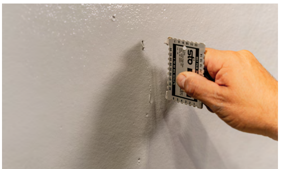
Maximum protection everywhere