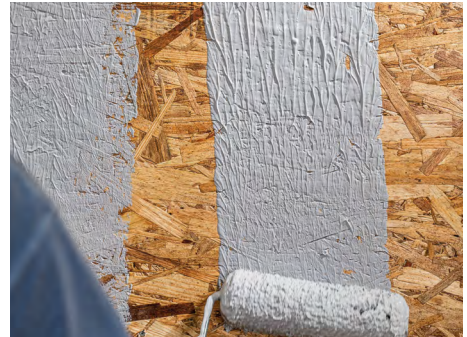
Oriented strandboard (OSB) and plywood share properties of both CMU and ASTM C1177 sheathing. Neither as smooth as gypsum sheathing nor as porous and moisture absorbent as CMU, on wood-based substrates thinner membranes provide fast drying. Weathered wood-based sheathing may require touchup or a second application of Sto AirSeal to obtain a void and pinhole-free membrane.