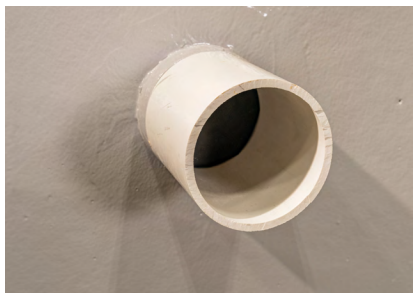
StoGuard Detail Components receive a fully compatible overcoat of Sto AirSeal for extra protection where it is needed most.