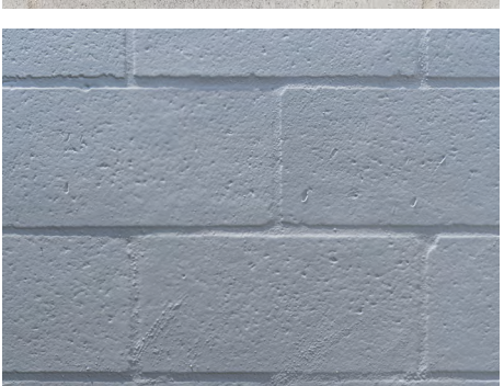
Concrete masonry units (CMU) are rough and porous, and draw moisture out of water-based products, helping them dry quickly. High-build membranes are well suited to the rough CMU surface.