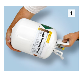
Hold cylinder horizontally and shake vigorously side-to-side for 10 to 15 seconds to mix contents.