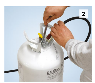
Hand-tighten hose fitting onto TurboStick cylinder. Cross-threading the fittings will result in leaks at the connection. Use properly sized open-end wrench to tighten fitting. DO NOT OVERTIGHTEN.

Hand-tighten hose fitting onto pistol inlet fitting. AVOID CROSS-THREADING. Use properly sized open-end wrench to tighten fitting. DO NOT OVERTIGHTEN.