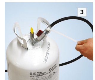
Verify the valve on the hose and the flow-control knob on the pistol are fully CLOSED. Secure hose to cylinder handle with plastic tie to protect hose and the connection from incidental damage during use.

Open cylinder and hose valve.Observe for leaks. DO NOT USE TOOLS TO OPEN OR CLOSE THE CYLINDER VALVE. CONTENTS OF CYLINDER ARE UNDER PRESSURE AND COULD CAUSE INJURY IF CYLINDER VALVE IS DAMAGED. DO NOT OVERTIGHTEN.