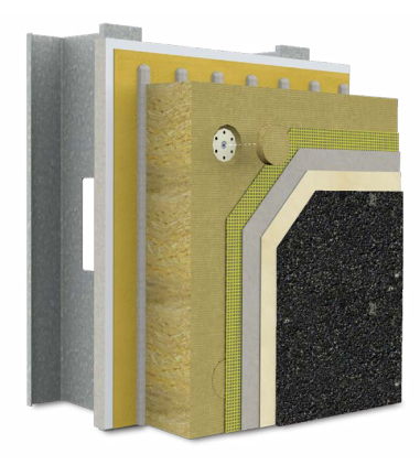
StoTherm® ci Mineral with Shasta finish