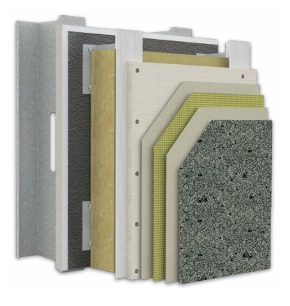
StoVentec® Render with Saguaro finish

StoCreativ Granite is an acrylic-based interior and exterior wall finish, formulated for durability and low maintenance for new construction or renovation. It is trowelapplied and designed to provide the look of cut or polished granite but in a versatile lightweight finish coating.