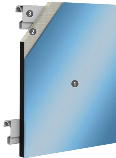
Sto Ventec Glass Panel Assembly: Sto opaque glass (1) fully bonded to 15mm Sto Carrier Board (2) with StoVentro™ Panel Profile (3)