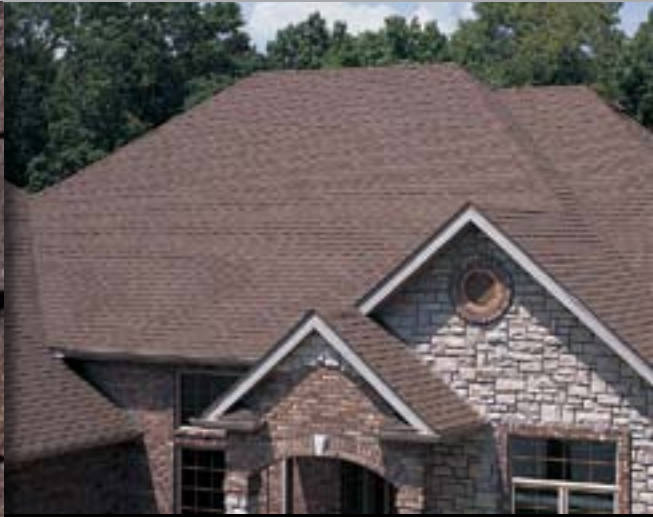
RUSTIC SLATE CLASSIC HERITAGE COLORS