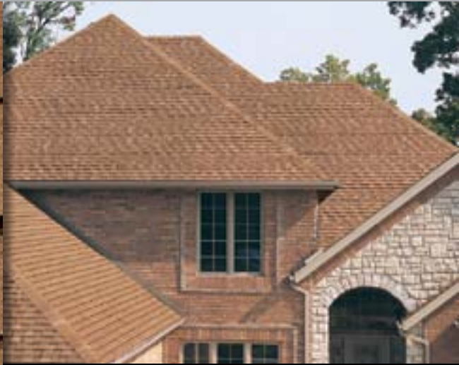
RUSTIC CEDAR CLASSIC HERITAGE COLORS