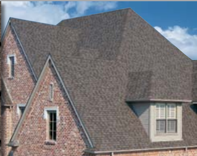
WEATHERED WOOD CLASSIC HERITAGE COLORS