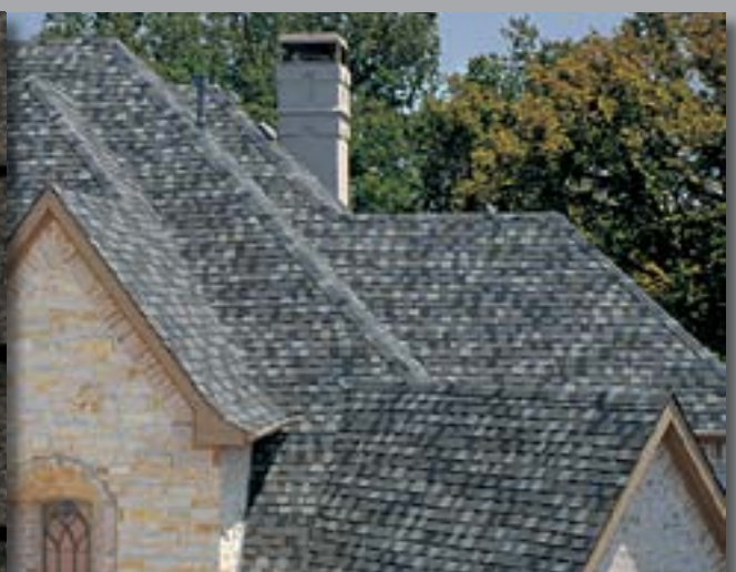
THUNDERSTORM GREY AMERICA'S NATURAL COLORS