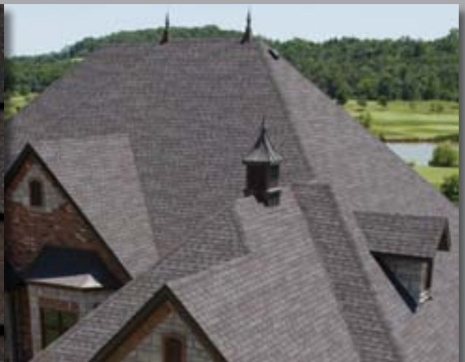
BLACK WALNUT AMERICA'S NATURAL COLORS