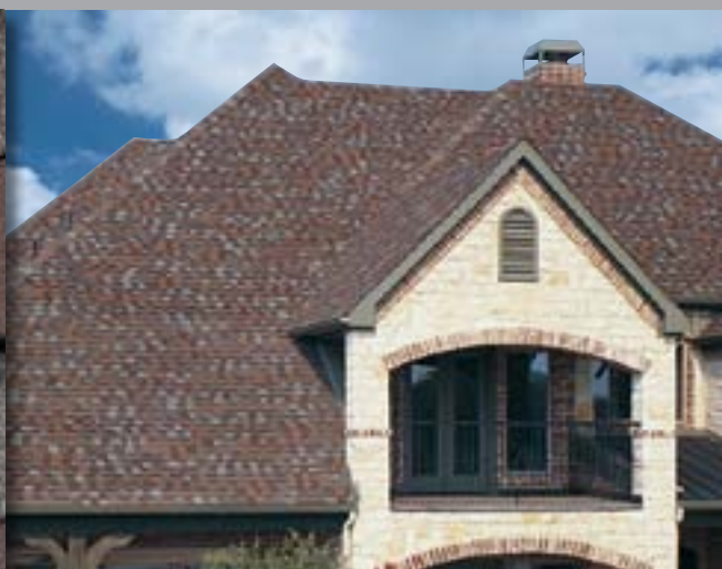
MOUNTAIN SLATE AMERICA'S NATURAL COLORS