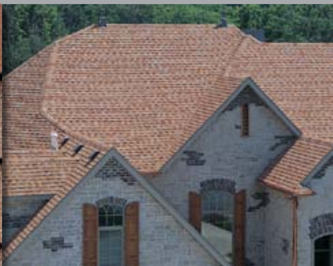
PAINTED DESERT • AMERICA'S NATURAL COLORS®