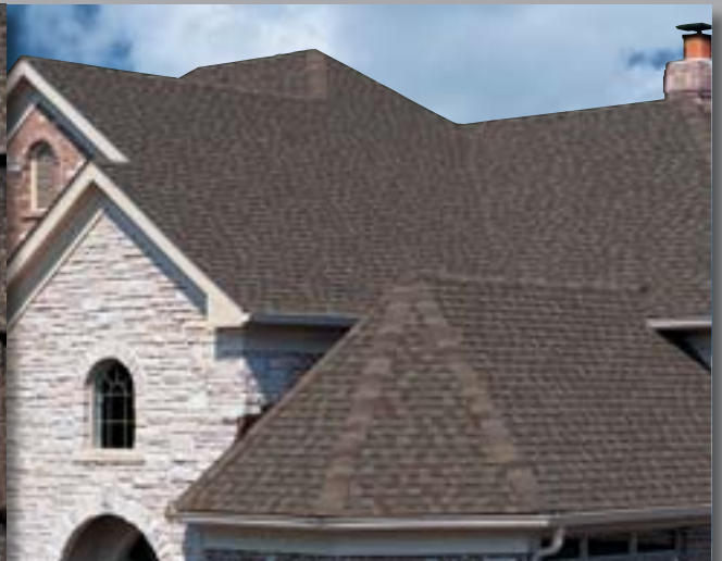
NATURAL TIMBER AMERICA'S NATURAL COLORS®