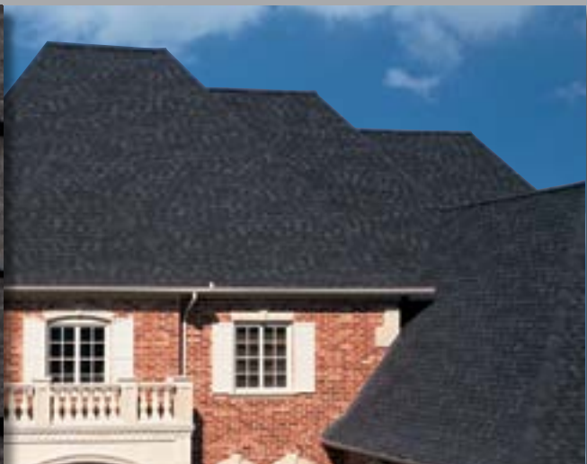
RUSTIC BLACK CLASSIC HERITAGE COLORS