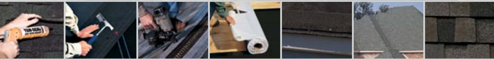
1 Cements and Sealants 2 Underlayments 3 Ventilation 4 Ice and Rain Protective Underlayments 5 Shingle Starter 6 Hip & Ridge Shingles 7 Heritage® Shingle Options