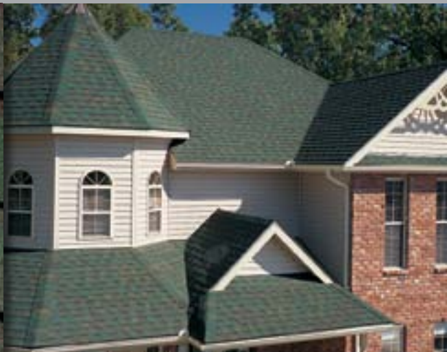
FOREST GREEN • AMERICA'S NATURAL COLORS