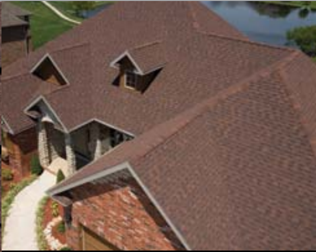
RUSTIC HICKORY • CLASSIC HERITAGE COLORS