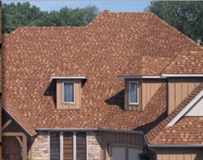
HARVEST GOLD AMERICA'S NATURAL COLORS®