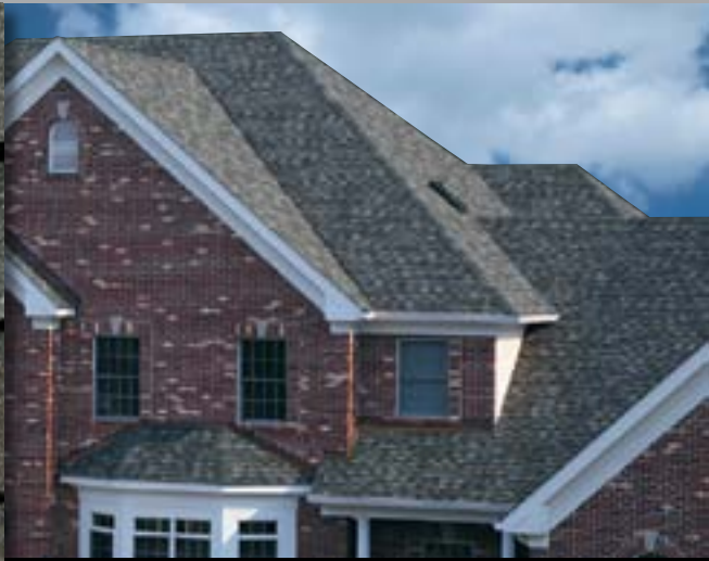
OXFORD GREY CLASSIC HERITAGE COLORS