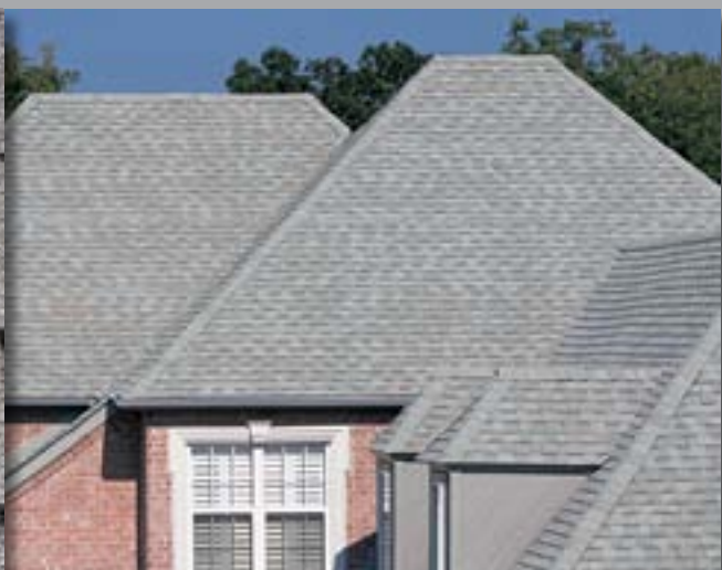
OLDE ENGLISH PEWTER CLASSIC HERITAGE COLORS