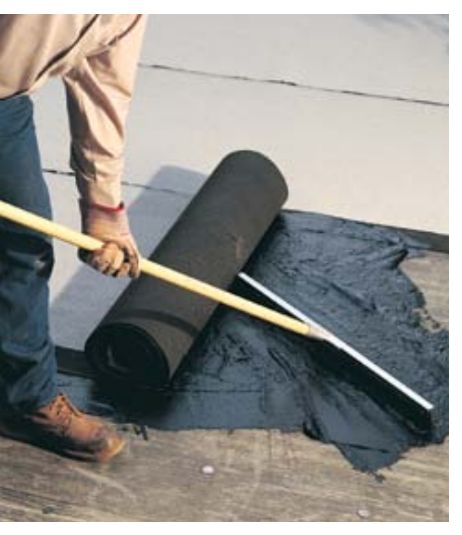
TAM-PRO Premium SBS Adhesive squeegee applied. TAM-PRO M3 Adhesive spray or squeegee applied.

Whether you're building a new addition or reroofing a porch or garage, there's nothing like TAMKO® Awaplan and Awaflex® products on a flat or low-sloped roof. Unlike typical low-slope roofing materials, Awaplan and Awaflex products are exceptionally flexible. They resist punctures and tears. And they can be applied with cold-process SBS-modified adhesive, so you don't have to worry about hazardous torching equipment on your roof. Your home is probably your single largest investment. Help that investment appreciate in value by roofing with Awaplan or Awaflex products. Tested by time. Trusted by roofers.