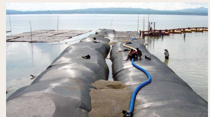
Geotube® Dyke for lakeshore reclamation.