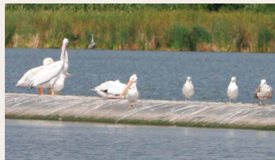
Geotube® Dyke for wetland engineering.

TenCate Geotube® Dyke Systems utilise locally available sand for the construction of dykes in waterways and impoundments. The Dyke Systems either reduce the use of rock or completely replace rock as material for construction of dyke structures. TenCate Geotube® Dyke Systems are ideal for use as river training dykes, reclamation dykes and dykes for water control. They are more economical and often have lower carbon footprints than the rock dykes they replace.