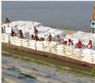
Deploying Geobag units by dropping into water.