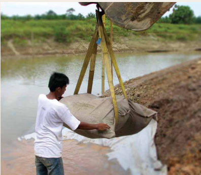
Lifting and positioning Geobag unit.

TenCate Geotube® Geobag units are manufactured from engineered fabrics combined with high capacity seams to produce bag or pillow shaped containers. When filled with sand or other soils, the bags are used as basic armour units for erosion protection works. They are engineered to provide strength, durability and soil tightness to perform during installation and during the operational life. They come in a wide variety of sizes and shapes that can suit practically any site handling conditions. TenCate Geotube® Geobag units are site-filled, closed and placed using standard construction equipment. They are easy to use and can be rapidly mobilised if necessary for emergency works. They are either lifted into position or dropped into water. TenCate Geotube® Geobag Systems are very versatile; they are used to construct revetments and other hydraulic structures, including filling of scour holes and closing of breached dykes.