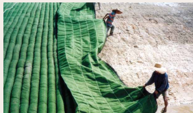
Laying Geotube® Sand Filled Mattress over prepared slope.

The Sand Filled Mattress is delivered in rolls which can be easily transported to site. Laid with parallel tubular sections running down the slope, each are hydraulically filled with sand through the top openings. The sand is introduced through a small hopper and washed down with water pumped from the waterway or impoundment. Adjacent rolls of Sand Filled Mattress are joined by seaming on site. Finally, the Sand Filled Mattress is anchored in a trench at the top of the slope.