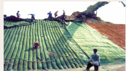
Geotube® Sand Filled Mattress hydraulically with sand.