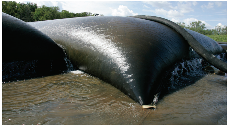
Volume reduction can be as much as 90%.

Discover more about TenCate Geosynthetics at geotube.com , call 706.693.1833 , or email c.timpson@tencate.com