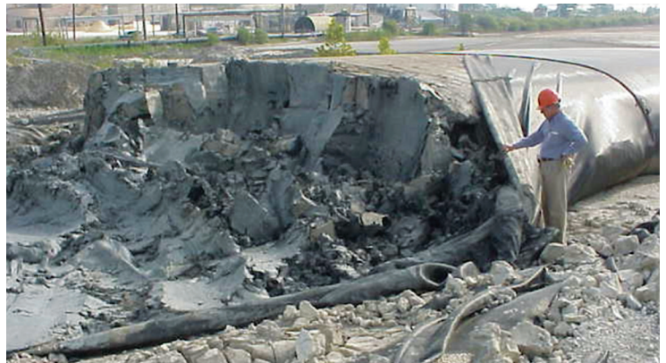
Consolidated ash residuals can be reused for various construction applications.