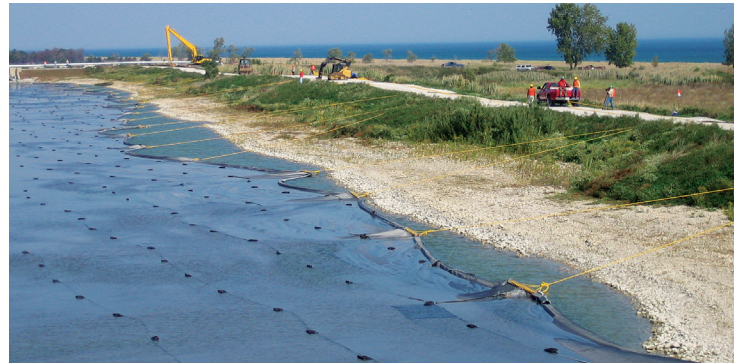
High seam strengths are critical to the field performance of the panels to prevent rupture during fill placement over the low-bearing capacity sludge/ash.