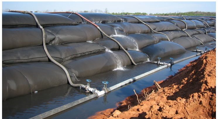
Flexible technology for projects large and small.