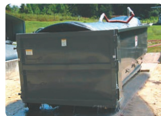
Geotube® technology simplifies the dewatering process. It can even be portable. Geotube® MDS (Mobile Dewatering System) units fit in a roll-off box.