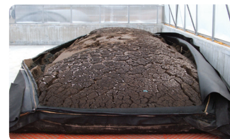
Dewatered solids can be easily removed and disposed of properly.