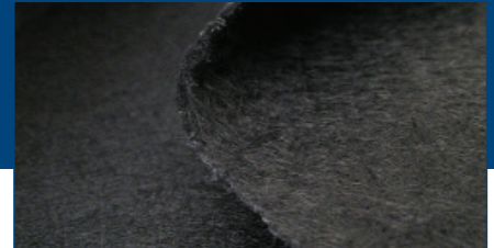
Mirafi® MPBBC1450 Nonwoven Bond Breaker