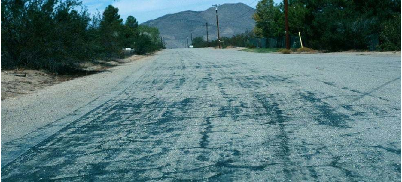
Figure 11: Saturated fabric with broadcast sand