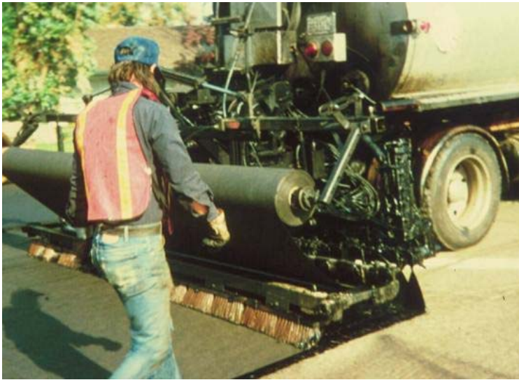
Figure 5: Distributor mounted equipment