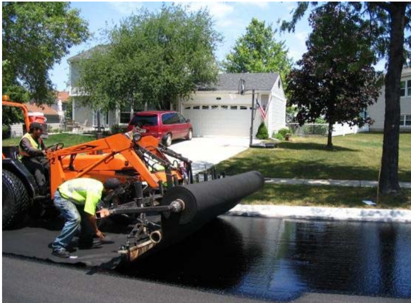
Figure 6: Tractor mounted equipment