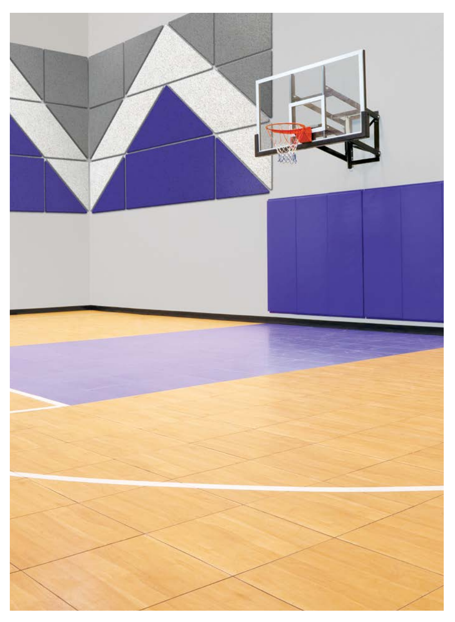
Tectum® Direct Attach Ceilings + Wall Panels