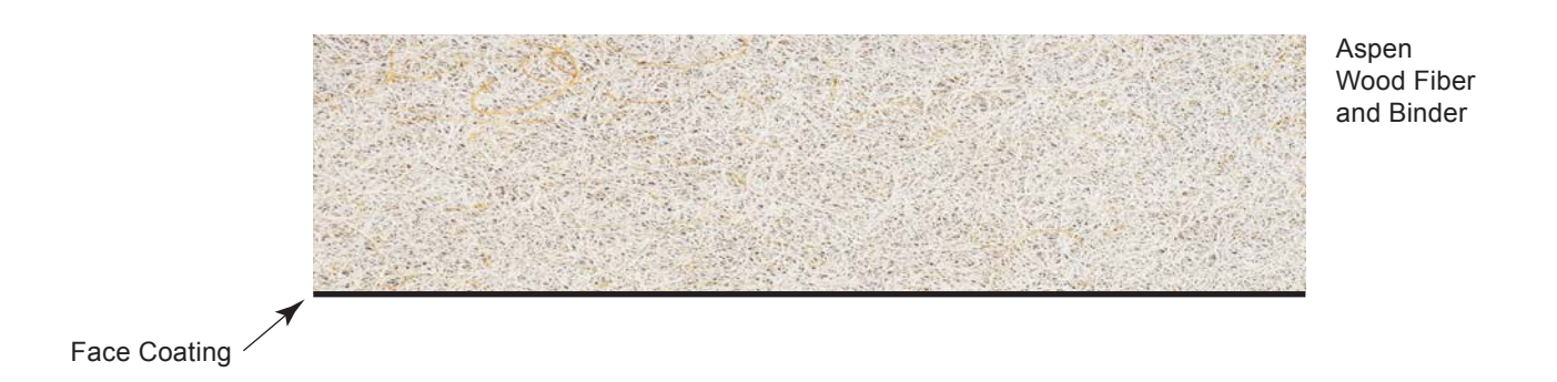
Figure 1. Composition of Tectum® Ceiling and Wall Panel