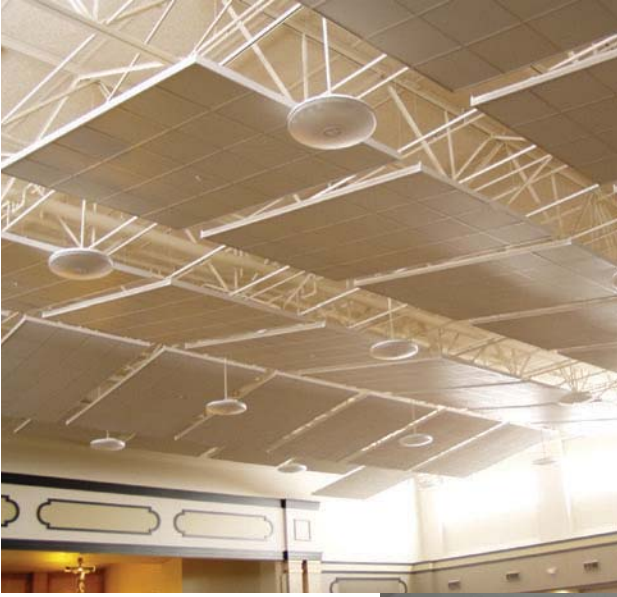
St. Michael the Archangel Overland Park, KS Tectum E Roof Deck