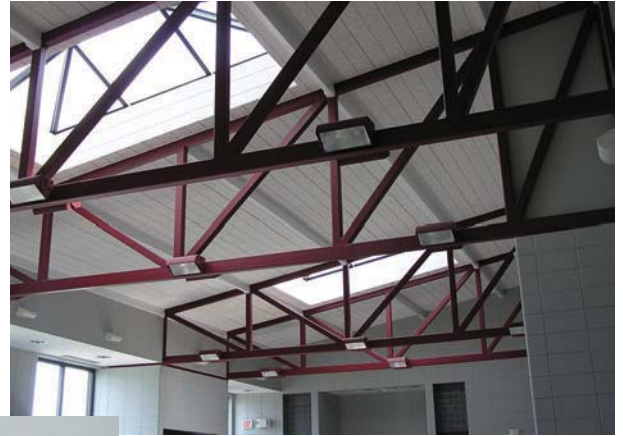
Carlisle County High School Bardwell, KY Tectum V-Line Ceiling Panels