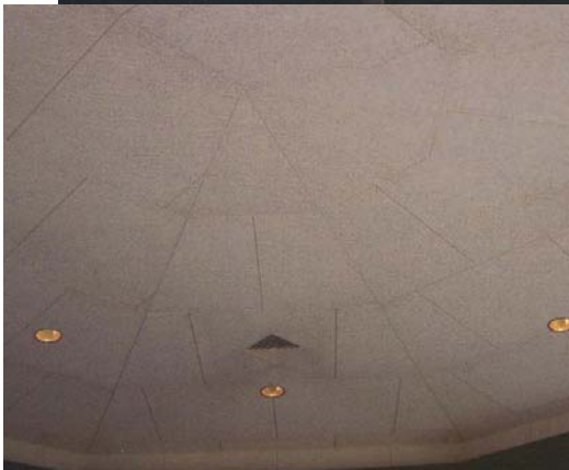
Thornberry Country Club Oneida, WI Tectum Ceiling Panels