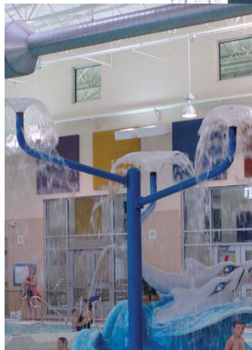
Lawrence Indoor Aquatic Center Lawrence, KS Painted Tectum Wall Panels