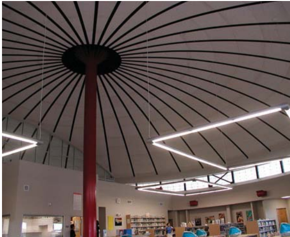
Cedarville University Cedarville, OH Tectum Acoustical Wall Panels