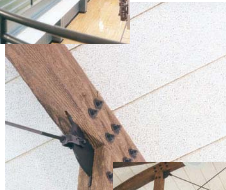
Chautauqua Lake Schools Chautauqua, NY Tectum V-Line Wall & Ceiling Panels