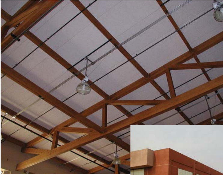
Palm Valley School Rancho Mirage, CA Tectum III Roof Deck Panels