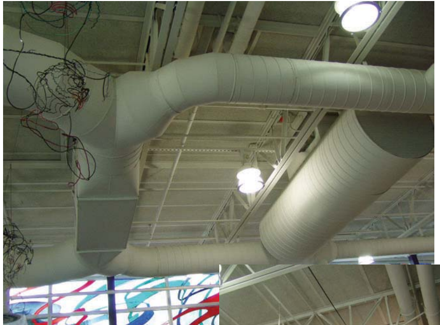
East Lawrence Activity Center Lawrence, KS Tectum I Roof Deck