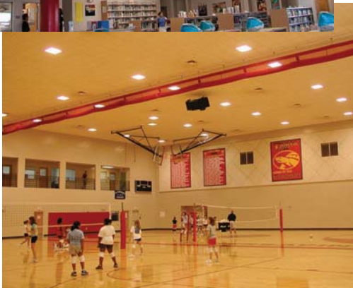
Tampa Preparatory School Tampa, FL Tectum Acoustical Ceiling & Wall Panels