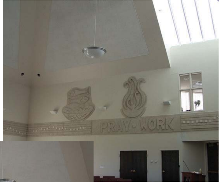
Mother of God Monastery Watertown, SD Tectum Wall Panels