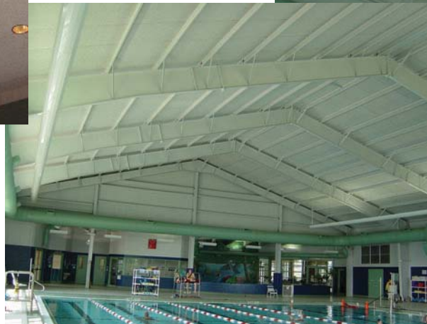
Lorain County Metro Park LaGrange, OH Tectum Structural Roof Deck