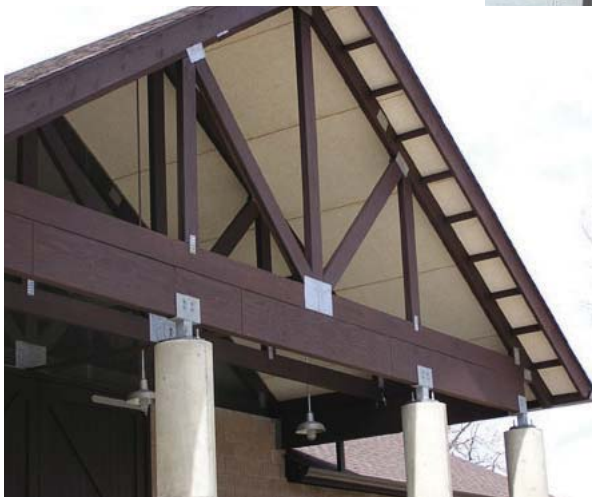
Newark YMCA Newark, OH Tectum E Roof Deck