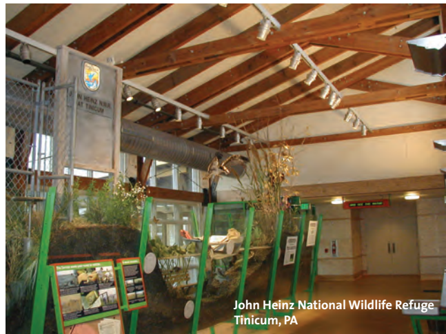
John Heinz National Wildlife Refuge Tincum, PA

Tectum panels provide acoustical treatment when abuse resistance is