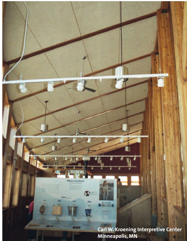
Carl W. Kroening Interpretive Center Minneapolis, MN

THERE IS NO ASBESTOS, NOR HAS THERE EVER BEEN ANY ASBESTOS, USED IN TECTUM PRODUCTS.