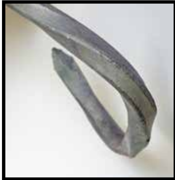
Genuine Tree Island Steel Hot-Dipped Galvanized ZincGard® Nail