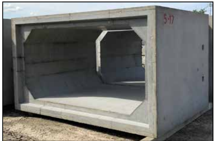
Finished Box Culvert