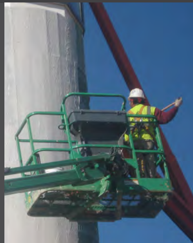
ExoAir® 230/230 LT