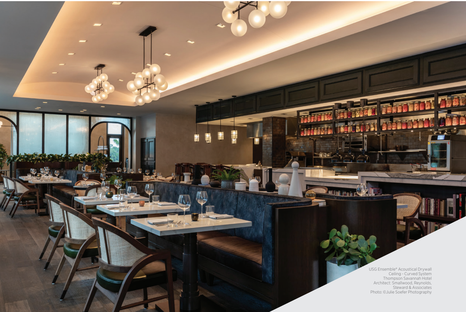
USG Ensemble® Acoustical Drywall Ceiling - Curved System Thompson Savannah Hotel Architect: Smallwood, Reynolds, Steward & Associates

SEAMLESS, CURVED APPEARANCE WITH EXCELLENT ACOUSTIC PERFORMANCE