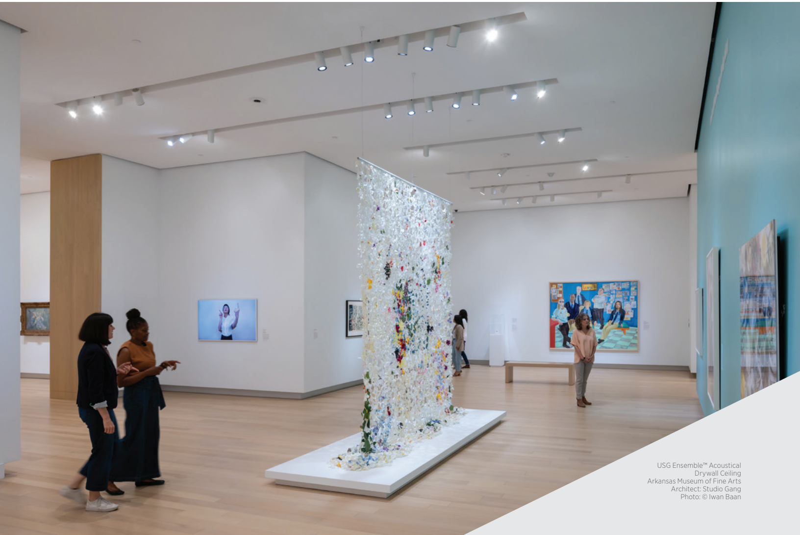
USG Ensemble™ Acoustical Drywall Ceiling Arkansas Museum of Fine Arts Architect: Studio Gang

SEAMLESS APPEARANCE WITH EXCELLENT ACOUSTIC PERFORMANCE