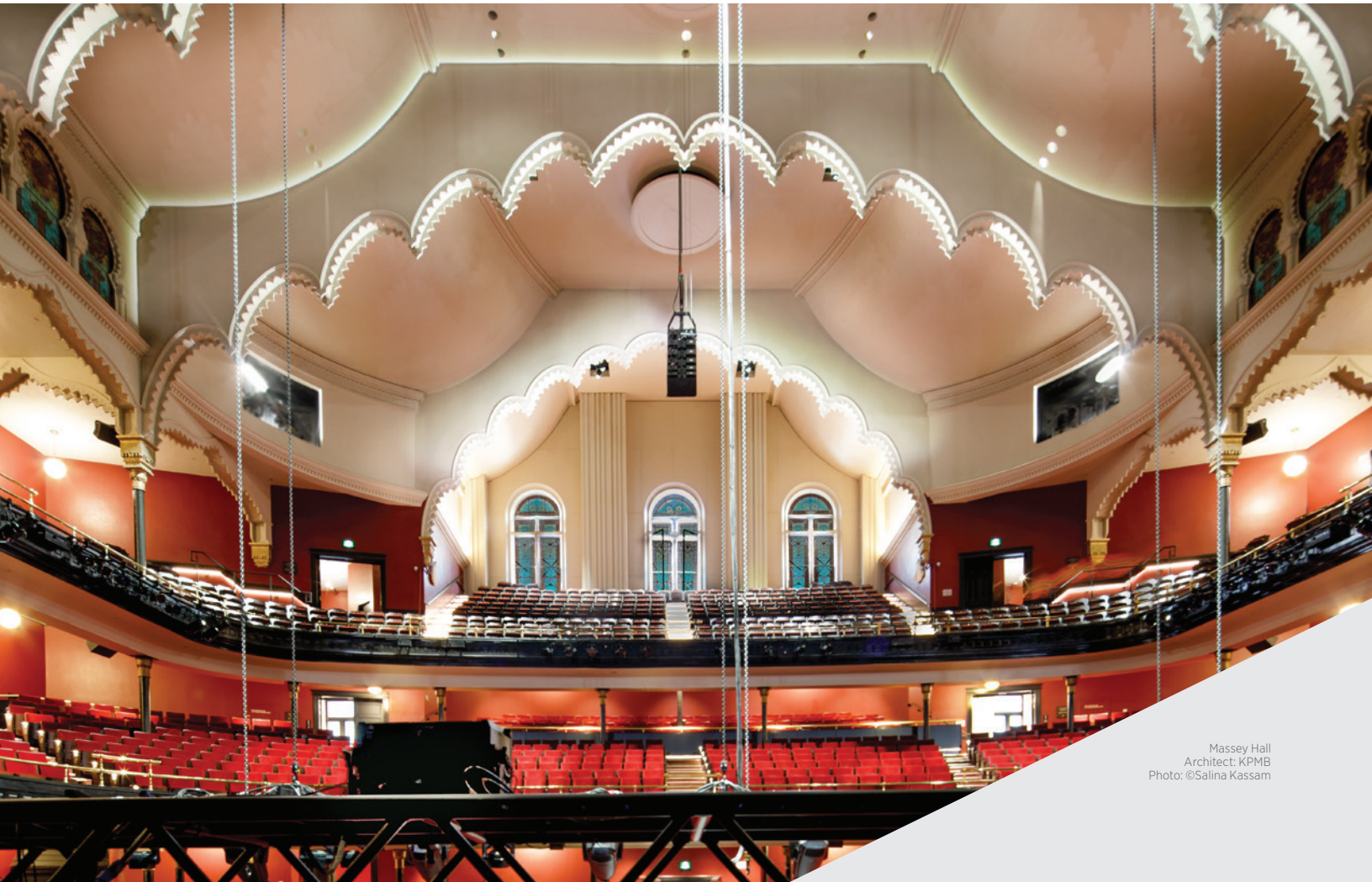
Massey Hall Architect: KPMB

SEAMLESS APPEARANCE WITH EXCELLENT ACOUSTIC PERFORMANCE