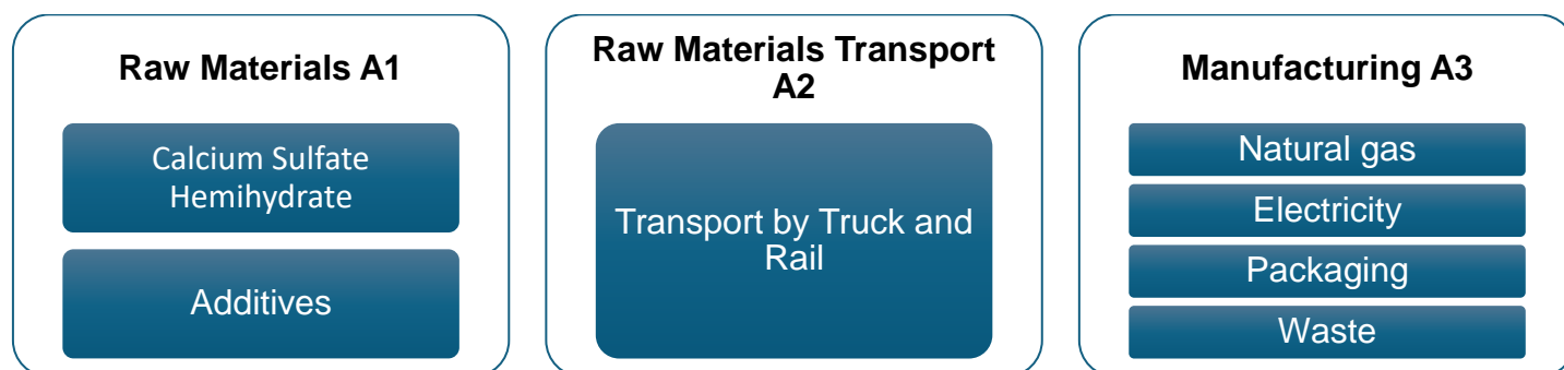
Figure 1: Specific processes covered by this EPD by life cycle stage

This EPD represents a “cradle-to-gate” LCA analysis for USG Structo-Base® Gypsum Plaster. It covers all the production steps from raw material extraction (i.e., the cradle) to finished product on wooden pallets (i.e., the gate).