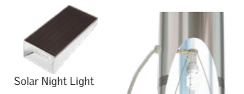
Solar Night Light