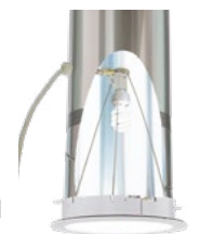
Light Kit (ZTL)