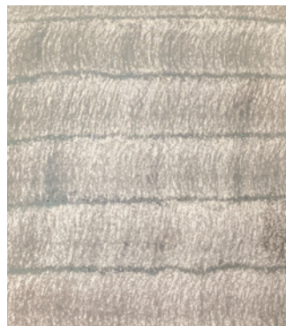
Proper Coverage on Insulation