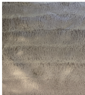
Proper Coverage on Membrane