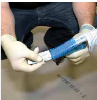
Application of petroleum jelly to spray gun