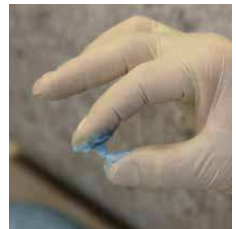
Performing the string-time test