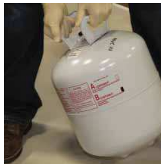
Shaking of A-side and B-side tanks