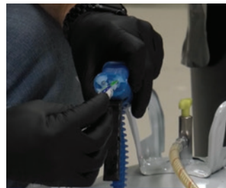
Application of petroleum jelly to spray gun