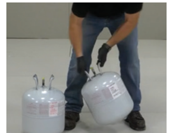
Shaking of A-side and B-side tanks