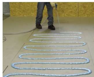
Apply using extension nozzle