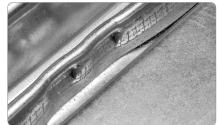
...and forget about it.